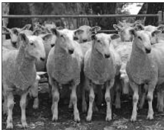
Ram lambs, genomic tested late 2017.