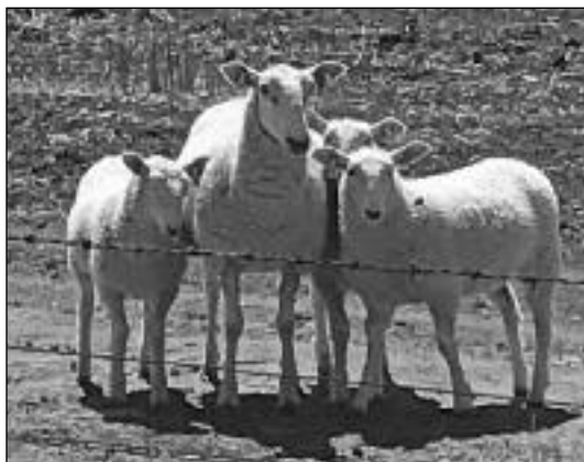
Ewe Tag 2 with her triplets. She weaned 75kg of lamb, and weighed in at 68kg herself at the time.