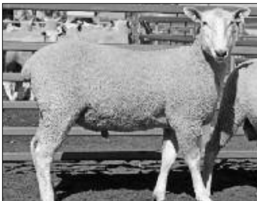
Lot 3 - Tag 40