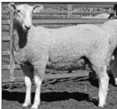
Lot 29 - Tag 148