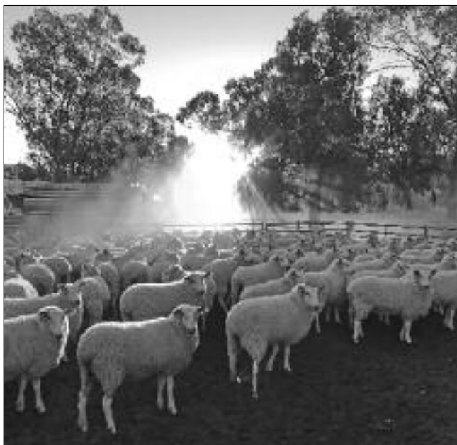
Unclassed ewe lambs 2018