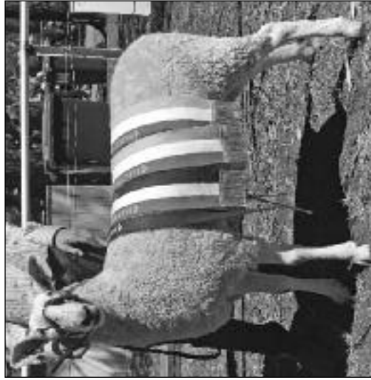
Champion Ewe Supreme Meat Sheep, Baradine Show, 2018.