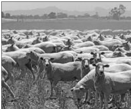
New Armatree first cross ewe lambs, January 2018.