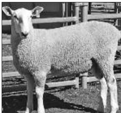
Lot 37 - Tag 373