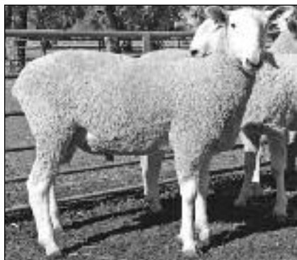
Lot 61 - Tag 182