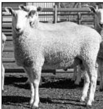
Lot 48 - Tag 29